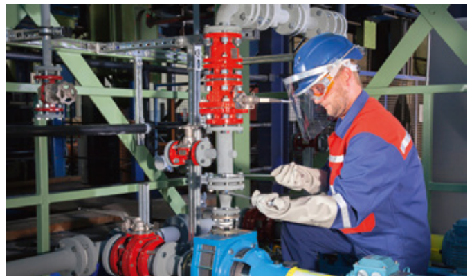
↑ Installation of DIABON® graphite pump

“Lifecycle Service”, our brand for services is based on four lifetime phases beginning from start-up up to the end of use. The intent is to provide our customers focused, state-of-the-art and sustainable solutions in all phases of their products life.